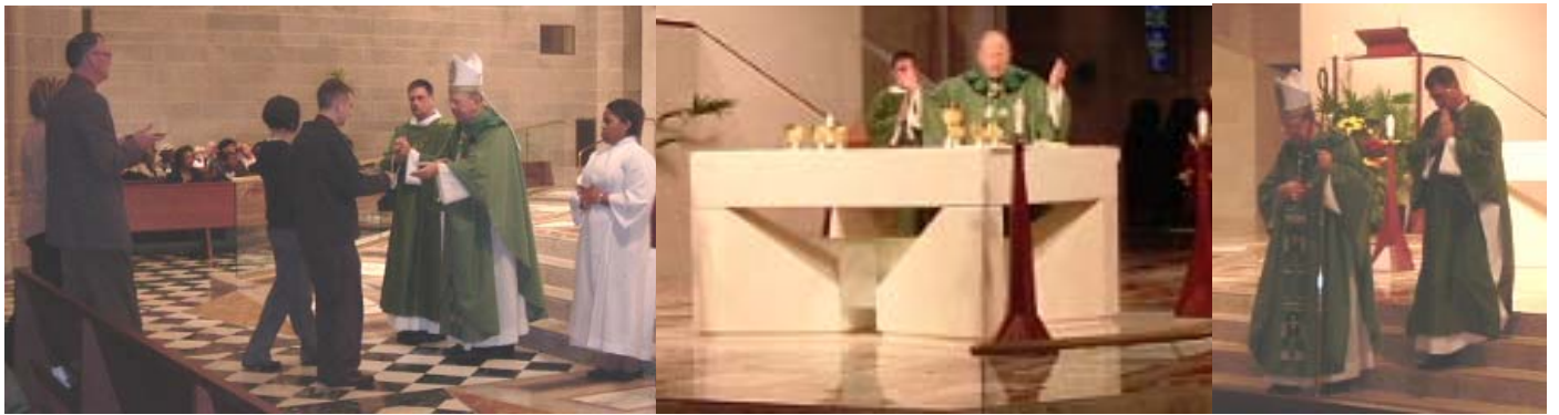
Liturgy of the Word