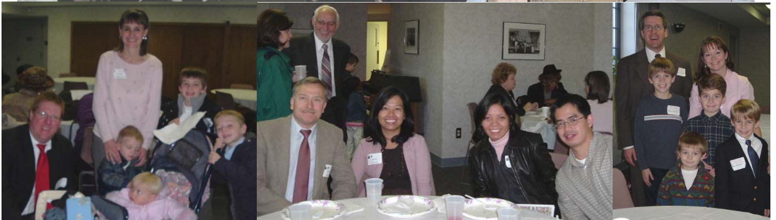
Couples joined in the social gathering after the Mass and expressed their gratitude for God's many blessings