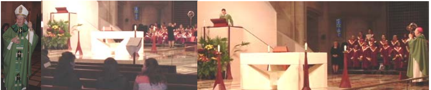
Liturgy of the Word